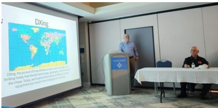
K3WW presentation at the January Meeting!