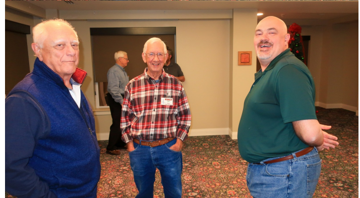
All November Pie Night photos courtesy Joe N3CRP.