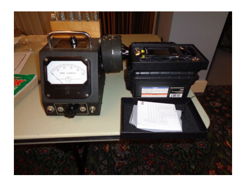
All meeting and show-and-tell photos courtesy Joe Rauchut, N3CRP