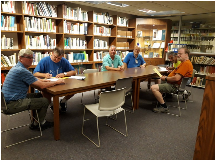
July 15th Testing Session